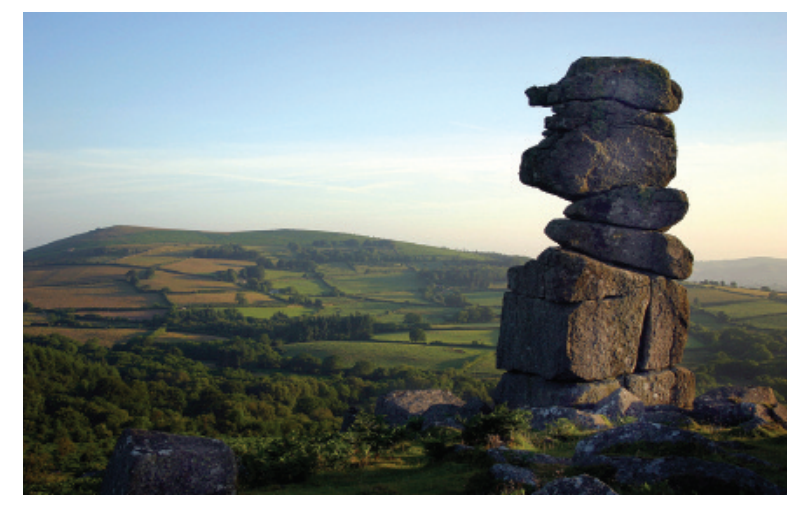
Bowermans Nose at sunrise.