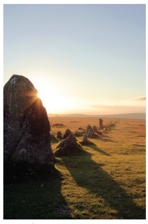
Merrivale Stone row at sunset.