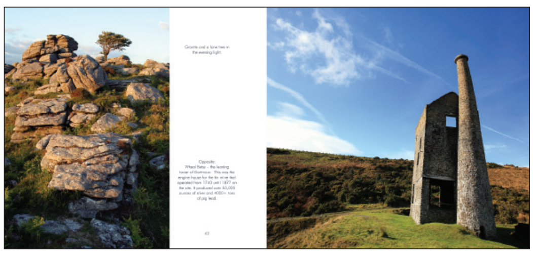
Example of a double page spread.