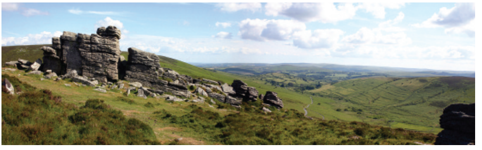
Panorama looking from Hookney Tor towards Widecombe.