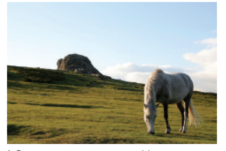
A Dartmoor pony grazes near Haytor at sunset.